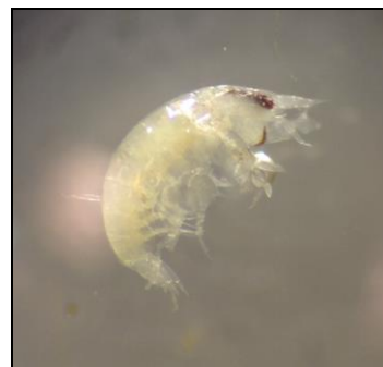
FIG. 2. Picture accompanying morphotype 43, which shows an amphipod under magnification.

Due to the great volume of invertebrates processed and the abundance of cryptic species in the sample pool, organisms found in samples were identified by morphotype (MT). MTs served as 'bins' for organisms which were not dissimilar enough to differentiate - MT43 (Fig. 2), for example, describes an amphipod with enlarged coxae, but in truth may encompass several species whose differentiation might require intense scrutiny or genetic analysis. When a specimen's affinity to an MT was uncertain, that specimen was always binned in that MT to prevent the undue proliferation of MTs. Each morphotype is accompanied by a preserved specimen and photo identification, and is identified to the lowest possible taxonomic level. Samples were placed in fresh