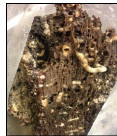
FIG. 4. The bored condition.