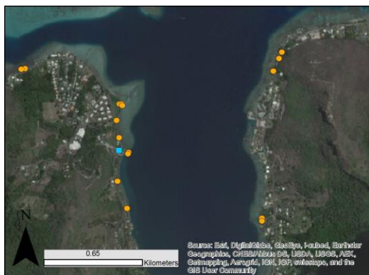
FIG. 1. Orange dots indicate woodfall sites sampled between October and November 2014. Blue square indicates UC Berkeley Gump Station.

All sampling took place on Moorea, French Polynesia. Woodfall sites were located and sampled in Cook's Bay in October and November 2014 (Fig. 1). At each site, samples were taken from the substrate beneath the woodfall, from substrate of similar composition outside of the woodfall's rot influence (1-2 m away), and from the woodfall itself. This yielded subsites of three types, hereafter referred to as 'wood,' 'close substrate,' and 'far substrate.' At each of these "subsites," at least three samples of substrate or wood were taken to properly represent the habitat's diversity. Samples were placed into